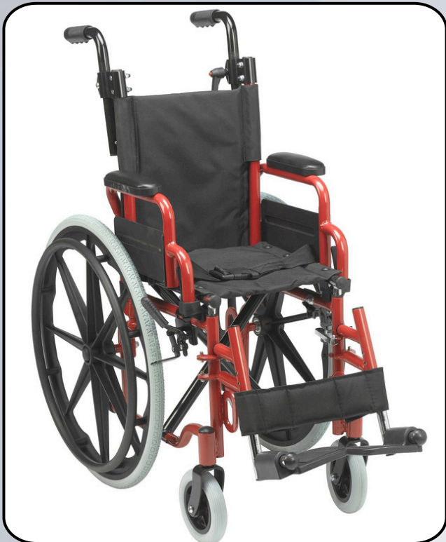
WALLABY PEDIATRIC FOLDING WHEELCHAIR