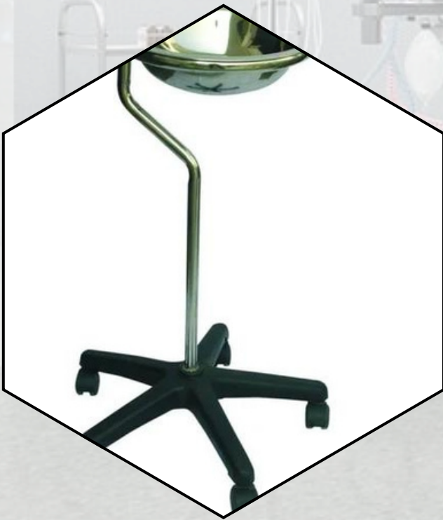
HOSPITAL WASH BASIN STAND