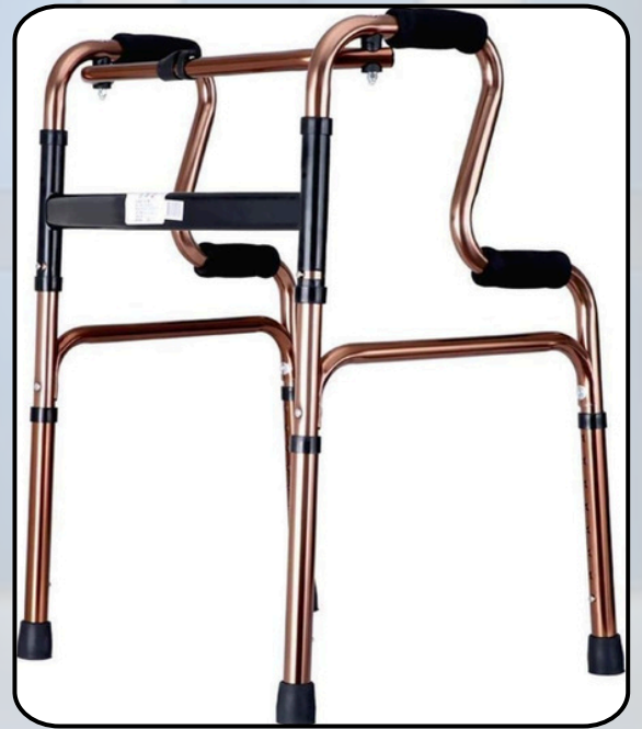
FOLDING MOBILITY WALKING AID