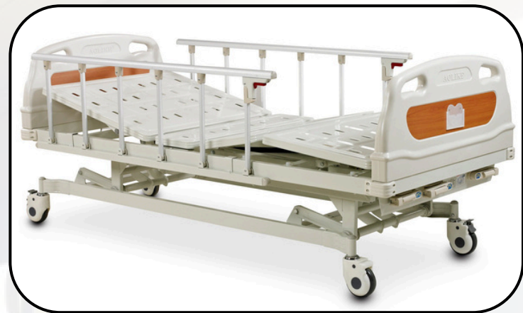
3 CRANK MANUAL HOSPITAL BED