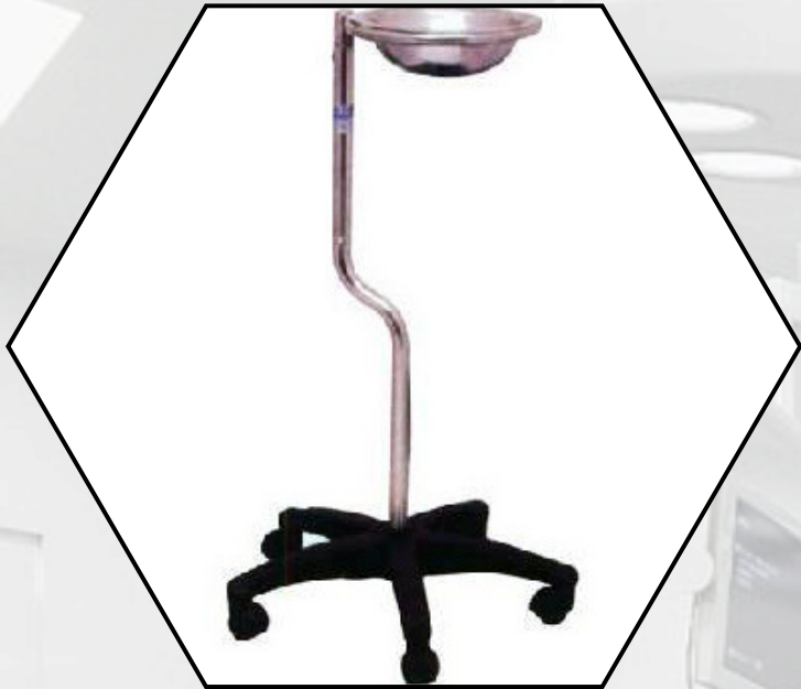
HOSPITAL WASH BASIN STAND