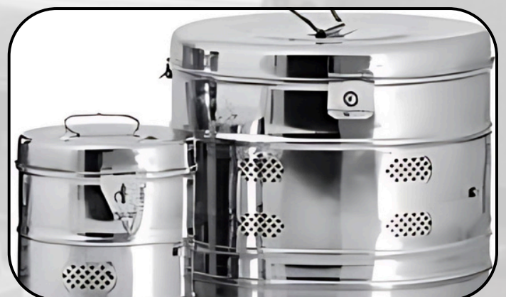
STERLIZER JOINTE WITH TRAY