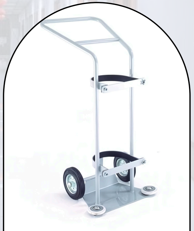
OXYGEN CYLINDER TROLLEY